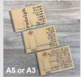
A5 or A3

A selection of items available from our iDesign Crafted in Orkney range - calendars, Christmas cards, illustrated cards, photo cards, sketch pads. All available in Isbister's store, direct from iDesign or from the iDesign section at shop.isbisterbros.co.uk