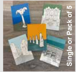
Single or Pack of 5