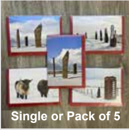
Single or Pack of 5